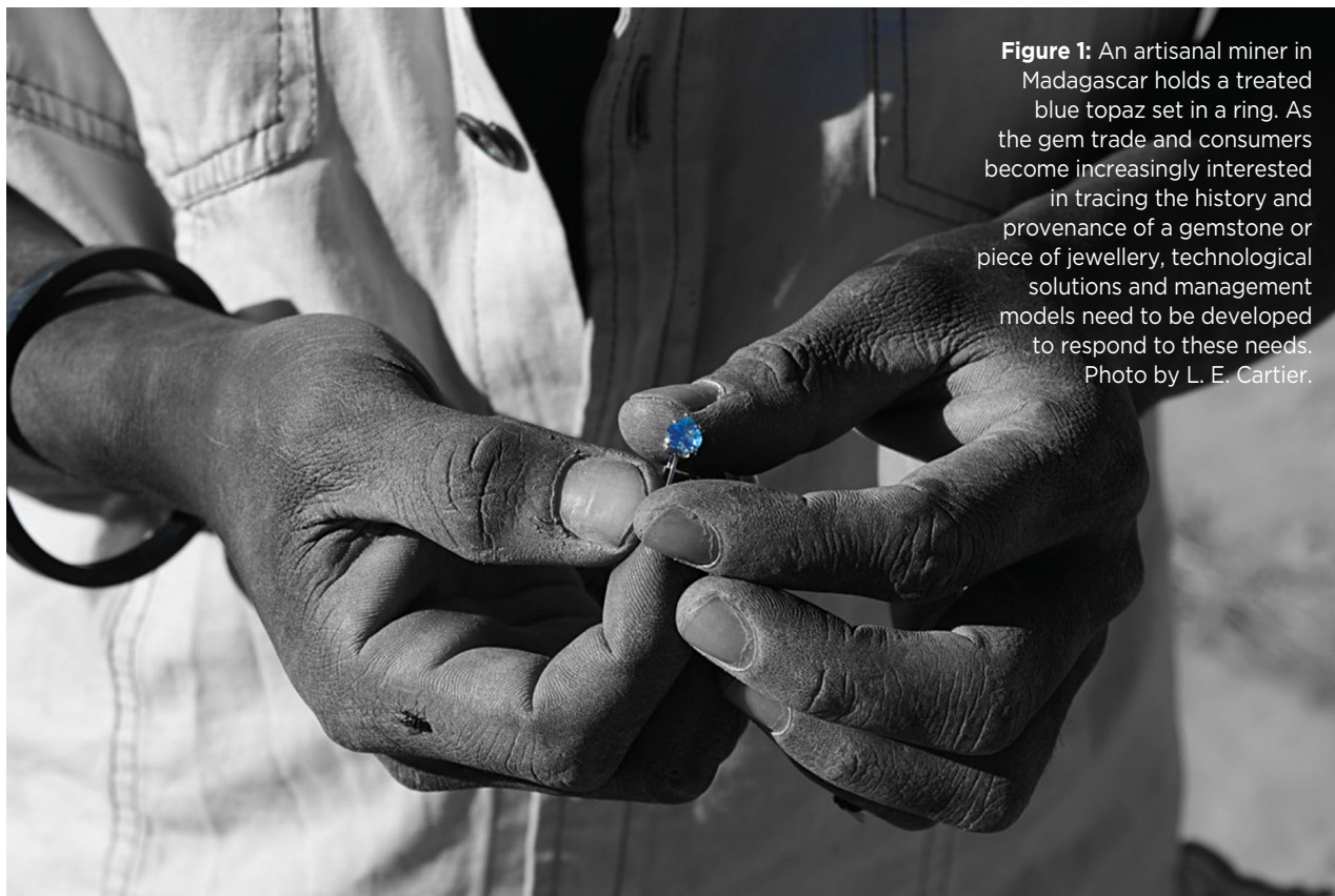
Figure 1: An artisanal miner in Madagascar holds a treated blue topaz set in a ring. As the gem trade and consumers become increasingly interested in tracing the history and provenance of a gemstone or piece of jewellery, technological solutions and management models need to be developed to respond to these needs.