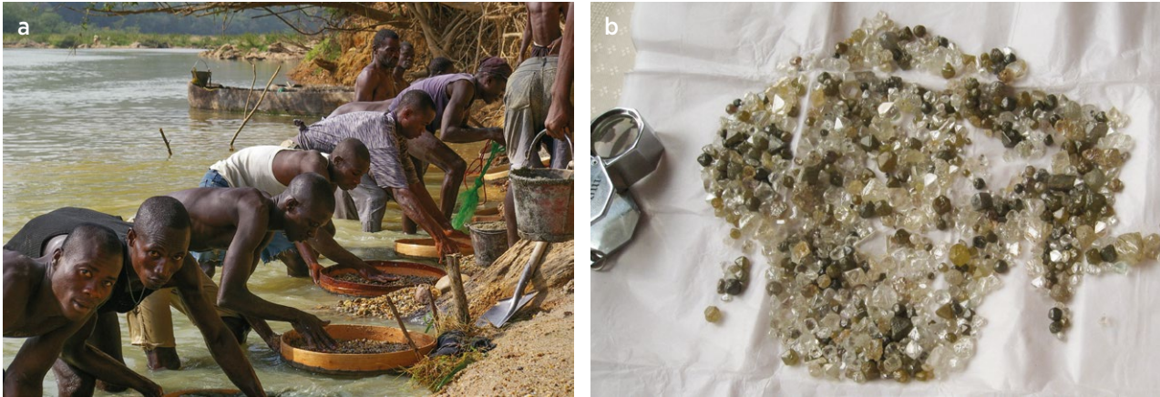
Figure 5: (a) Artisanal diamond miners sift gravels on the Sewa River in Sierra Leone. (b) A mixed parcel of rough diamonds from Sierra Leone was produced by such diggers. Programmes such as the GemFair initiative aim to bring certified responsibly produced artisanal diamonds to market, and complement this with blockchain to document the path of the diamonds.

bitcoin using proof-of-work protocols; see O'Dwyer and Malone, 2014; Orcutt, 2017) must be taken into consideration when deciding what kind of ledger is selected and how it is managed and organised.