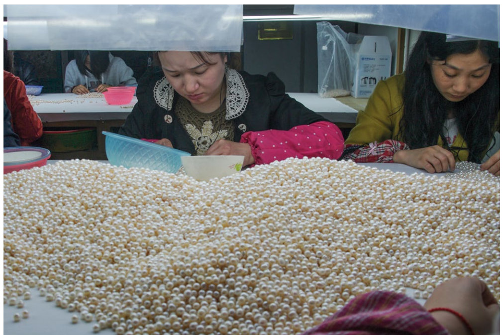
Figure 6: At a processing facility in Hunan, China, freshwater cultured pearls are aggregated from different farms and sorted according to various characteristics. Such processing on the basis of quality rather than source poses a challenge for traceability.

Country-of-origin determination is not a stand-alone traceability solution, but it offers independent verification of claims made about a gem's locality. This model has also been explored for tin, tungsten and tantalum (coltan) supply chains via the analytical fingerprint method (Schütte et al., 2018). Gemmology can complement and supplement the claims and documentation made by more standard traceability approaches that are inspired from other industries. The informal and highly fragmented nature of the coloured stone industry is likely to place stronger reliance on innovations in traceability rather than common tracking techniques that are more feasible for gold, diamonds and other commodities.