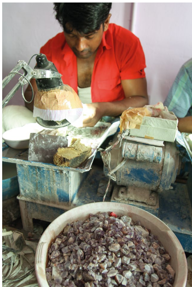
Figure 7: At an amethyst-cutting workshop in Jaipur, India, rough material is generally purchased and sorted by size and quality rather than according to specific sources. The cutting and polishing of gems is an under-researched bottleneck for traceability.