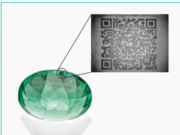
Figure 3: A tiny QR code can be inscribed on a gemstone during chemical analysis with GemTOF instrumentation (Wang and Krzemnicki, 2016). The QR code shown here measures 500 \times 500 \mu\text{m} and has been inscribed on the girdle of an emerald weighing 2.5 ct. The material ablated during the inscription of the code is used to measure trace-element concentrations that are evaluated for determining country of origin. The code can be read (after magnification) using a QR reader on a smartphone, and gives the user access to various types of information on the stone.

The Organisation for Economic Cooperation and Development (OECD) recently developed the guidelines followed by companies seeking to respect human rights and avoid contributing to conflict through their mineral sourcing decisions and practices; these guidelines now