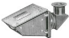
Fig. 5. Refractometer (Model No. 9)